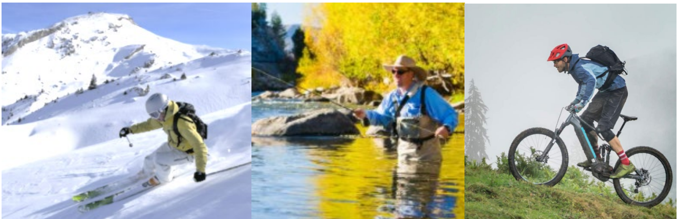
Sample Inspirational Images

Montrose serves as a basecamp for visitors to the western mountain range, hosting attractions and ski areas such as the Black Canyon National Park, and mountain resorts of Telluride and Crested Butte.