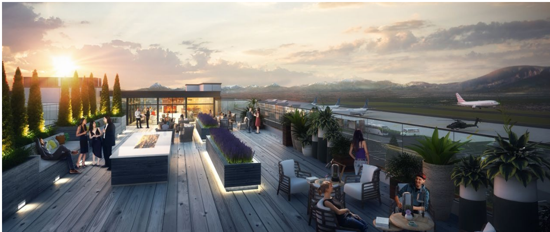
Conceptual Rendering of the Rooftop Terrace

Until now, the Montrose Airport has not had a hotel on site, nor one of this distinction within the immediate area. This location will give travelers a long-needed and desired place to stay at the airport and will feature a rooftop restaurant & lounge with views of the Grand Mesa and Uncompahgre Valley to the north Uncompahgre Plateau mountains to the west, snow-capped San Juan mountains to the south, the airport and stunning sunsets to the west, a 360 degree view. The rooftop area will highlight live music to be enjoyed by travelers and locals alike.