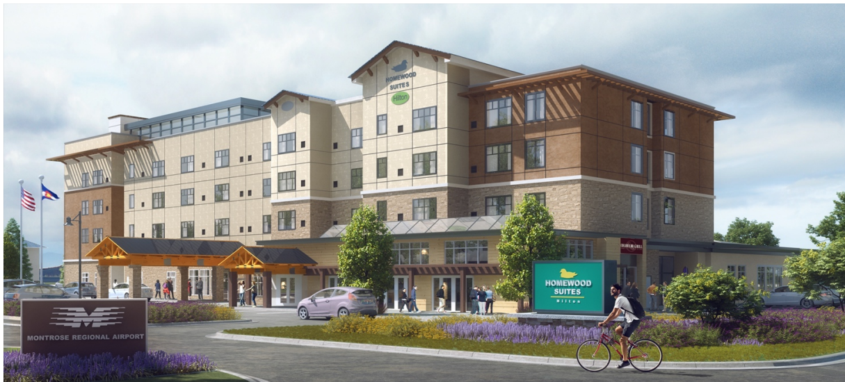
Conceptual Rendering of the Front View

SunCore Hospitality Montrose Airport Hotel, LLC (SunCore) is proud to announce the building of a 118 room Hilton Homewood Suites in Montrose County, CO at Montrose Regional Airport (“MTJ”). The site is on the existing vacant parcel next to the terminal and adjacent to N. Townsend Avenue. This brand-new hotel is an excellent opportunity for this all-season market.